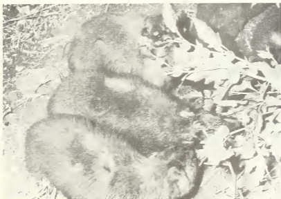
Plate Ic Browsing hyrax, showing how the head is turned sideways as vegetation is bitten off with the molars.